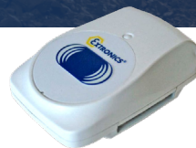
Extronics AeroScout Wi-Fi-based RFID tags are supported by Rajant's network

Rajant has partnered with Extronics to support its AeroScout Wi-Fi-based active RFID tags for personnel and asset tracking. Because Rajant's network never breaks for handoff, tracking of personnel and assets is highly reliable and can also be used to identify productivity bottlenecks in real-time to improve operational efficiency.