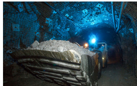
Enables tele-operation of an LHD between shifts and autonomous control from the muck pile to the ore pass