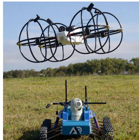
Australian Droid + Robot's Explora droids for underground inspections has Rajant's BreadCrumb technology integrated

An example is the Explora underground mapping and inspection robot by Australian Droid + Robot, which has Rajant's BreadCrumb technology onboard—enabling its ability to independently perform visual inspections, thermal imaging, laser survey scanning, gas sensing, and other tasks to identify and or operate in hazardous mine conditions. Rajant's network also uniquely enables these autonomous systems to communicate vehicle to vehicle to create an autonomous mesh network to manage their movements throughout the mine.