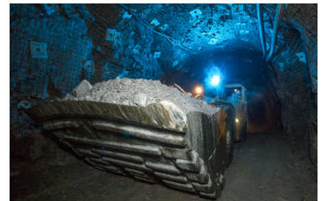
Enables tele-operation of an LHD between shifts and autonomous control from the muck pile to the ore pass