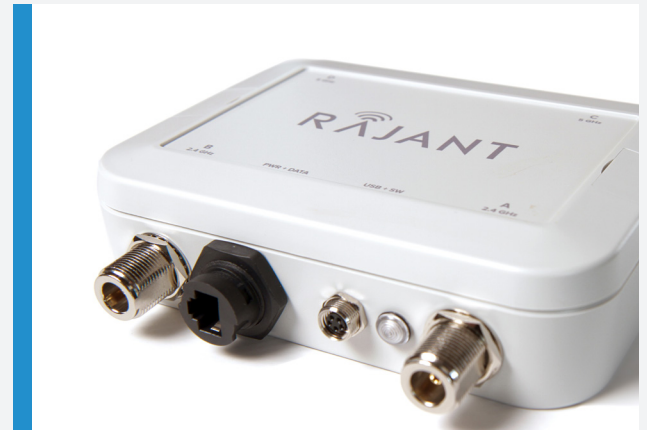
The BreadCrumb ES1 is an IP67 device with multiple mounting options, making it ideal for IIoT applications like those running on smart grid devices and for deployment on light-duty vehicles.