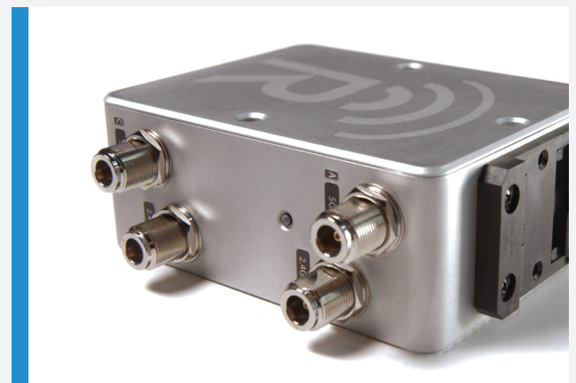
The BreadCrumb KM3 is intended for deployment inside pre-existing outdoor NEMA enclosures, featuring flexible DIN rail mounting to make deployments even easier and faster.