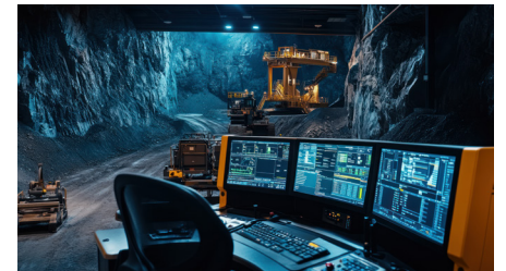
Enables tele-operation of an LHD between shifts and autonomous control from the muck pile to the ore pass.

Learn more about Rajant's Intelligent Edge capabilities to enhance your existing communications and environmental monitoring data-highway to improve safety, production, and operations at www.rajant.com