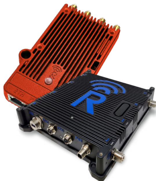
Rajant Cardinal and Hawk BreadCrums®

Together they create a complete underground and tunnel-wide wireless network for mission-critical data, video, and voice communications. The system can also be used to supplement existing fiber and cable "hot spot" networks, provided via vertical shaft access levels, portals and tunnels.